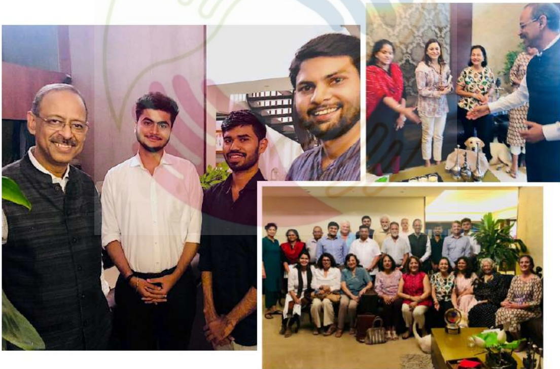
Glimpses from the get-together